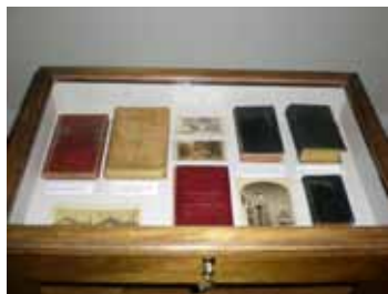
Some of our precious Cathedral historic archives.