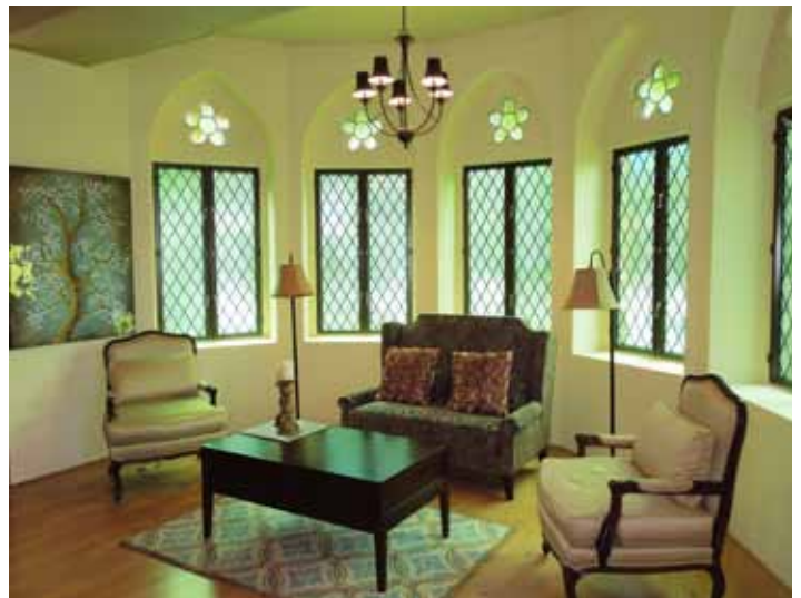
The new Bride's Solarium marks completion of Phase Ia of the Davies Hall Renovation