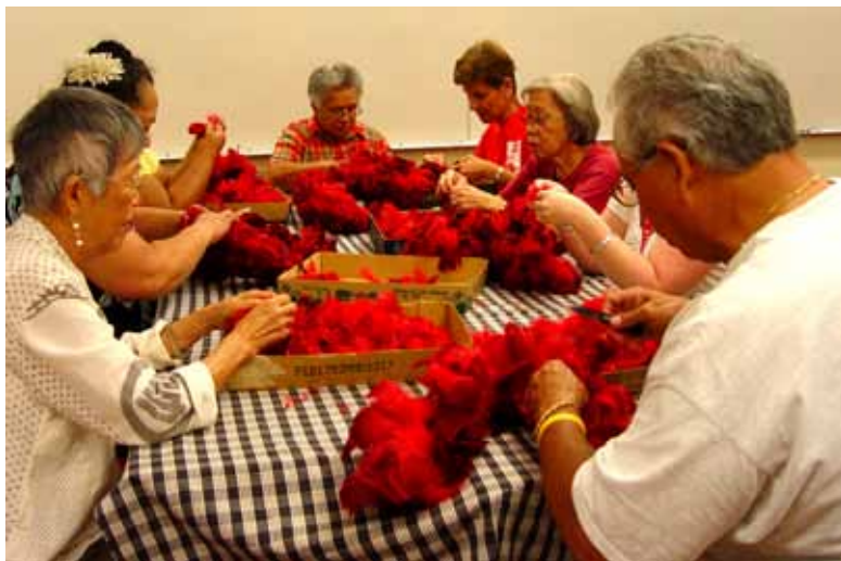
Hawaiian Committee and friends constructing the new Cathedral kahili.

Chapter Member, Hawaiian Committee Member, President, 'Iolani Guild